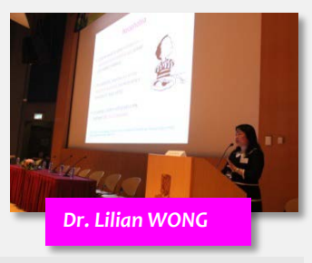
Highlight from Overseas Speakers